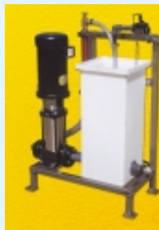
PE020 Solution Distribution System