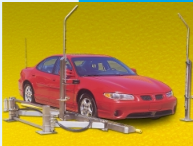
PE140 High Pressure Side Follower