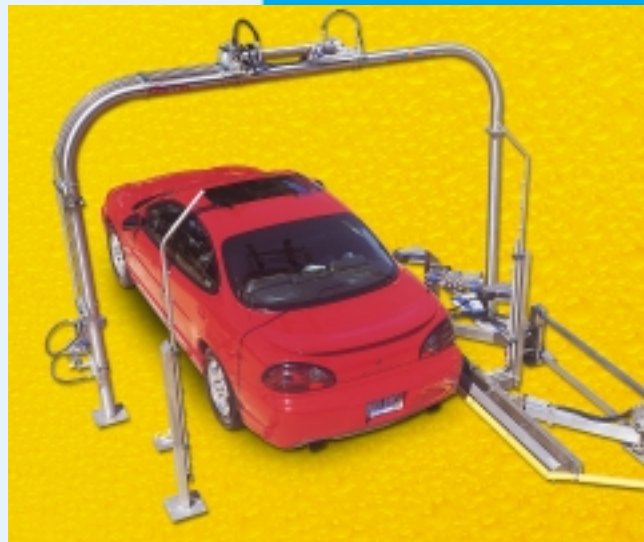
PE905 & PE140 High Pressure Flip Arch and Side Follower