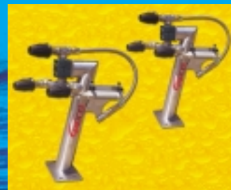
PE700 Wheel Tracker System